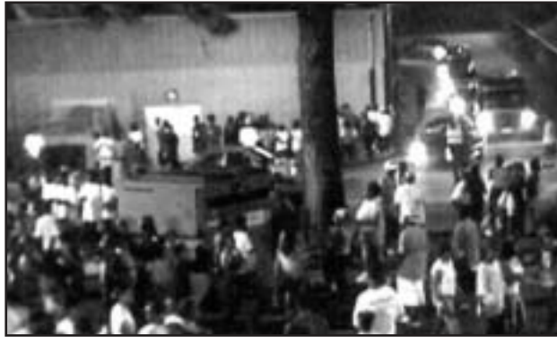
The sheer number of youth hanging out, such as around this roller skating rink, can generate public concern.

Among the specific behaviors (some legal and some not) commonly associated with youth disorderly conduct are