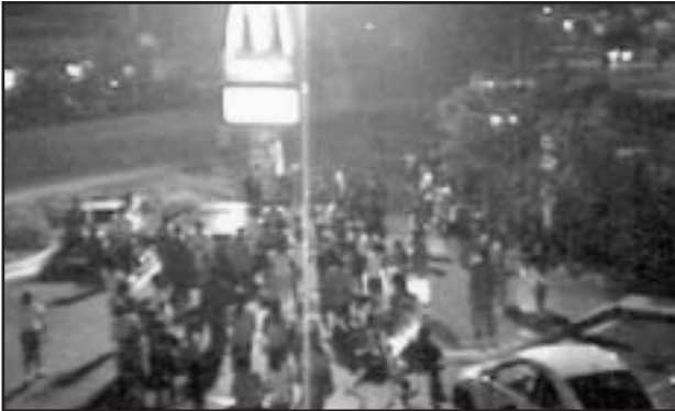
Fast-food restaurants are popular locations for youth to hang out.

Disorderly youth are of particular concern to merchants because their presence intimidates shoppers, threatening revenues. Shoppers also frequently cite menacing youth as among their primary safety concerns. 2 However, young people themselves are a source of current and future revenue and, if treated poorly by merchants, will likely remember that treatment years later when choosing where to spend their money. Merchants are more likely to tolerate some disorderly