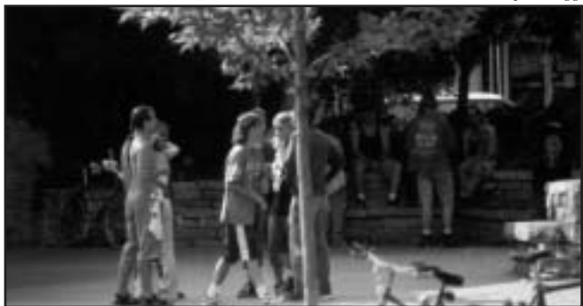
Congregating in public is an important aspect of youth socialization.